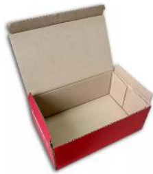
Glue spraying cover