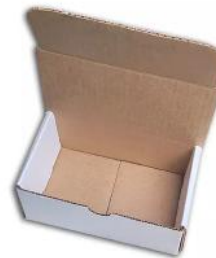
Reinforced load-bearing box