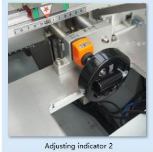
Adjusting indicator 2