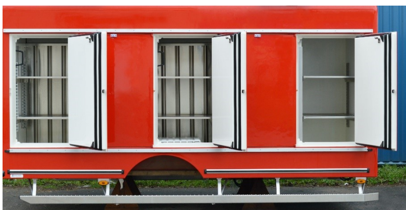
Insulated compartment with independently operated eutectic plate

Carlsen Baltic is a long-established producer of deep freeze distribution bodies for lightweight commercial transport. Solutions by Carlsen are equipped with eutectic cooling systems providing energy efficient operations, fast pull down and durable holdover at low temperatures. Constant innovations and focus on quality enable the company to maintain weight and efficiency leadership within deep freeze distribution sector in the EU.