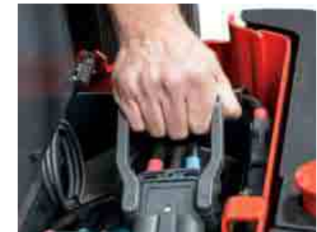
Figure 1: On battery top