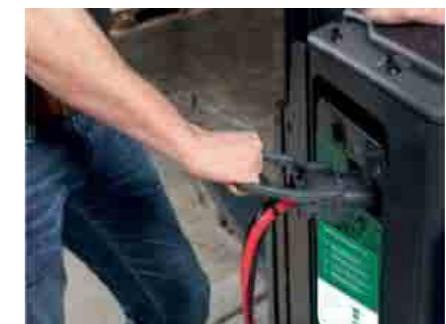
Figure 2: On either of the tray sides