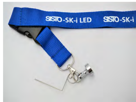
Programming magnet with practical lanyard