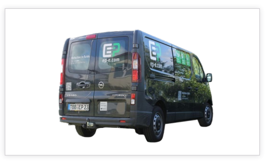
1 Calibration on-site