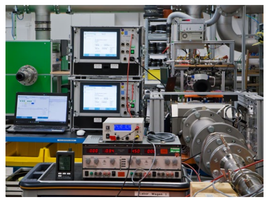
Calibration lab Niederstetten

To ensure consistent quality, calibrations of measuring elements are inevitable and should be scheduled at fixed time periods.