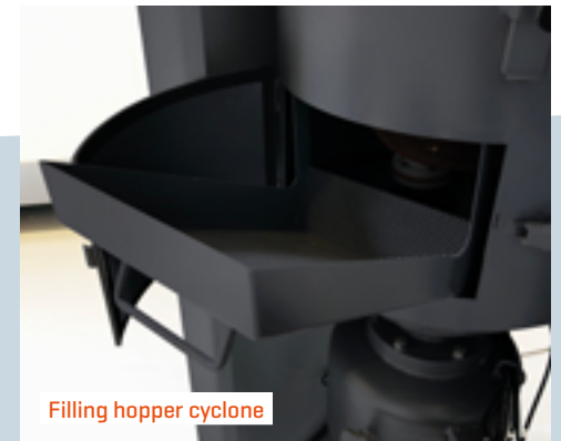
Filling hopper cyclone