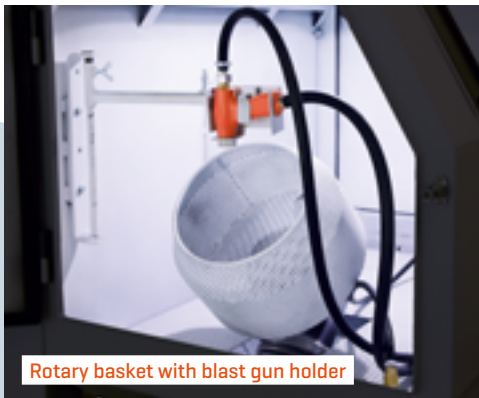
Rotary basket with blast gun holder