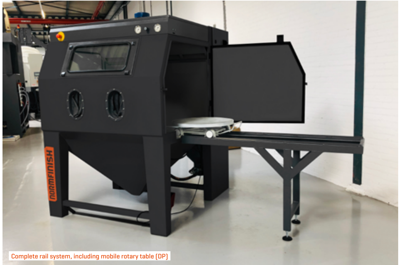
Complete rail system, including mobile rotary table [DP]