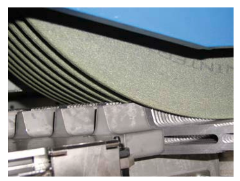
Grinding of hedge trimmers