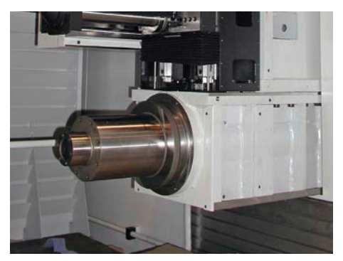
Continuous dressing device for grinding wheels up to 300 mm