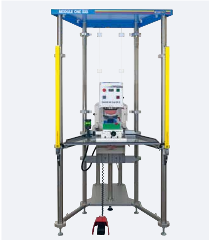
MODULE ONE XXS with pad printing machine SEALED INK CUP 90 E

The MODULE ONE XXS consists basically of a compact frame, a safety enclosure as well as the three standardized components: Light curtain, angle table and cross slide. The pad printing machine will be individually selected from the machine series HERMETIC, SEALED INK CUP E and V-DUO.