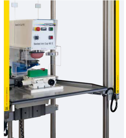
Angle table with storage shelf

A continuously height adjustable angle table allows the printing of parts with different heights .