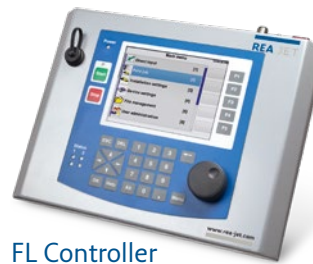
FL Controller Unit