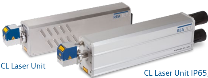
CL Laser Unit