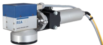
FL Laser Unit