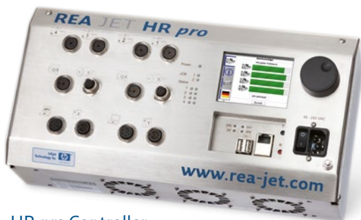
HR pro Controller for mounting in machines, up to 4 print heads