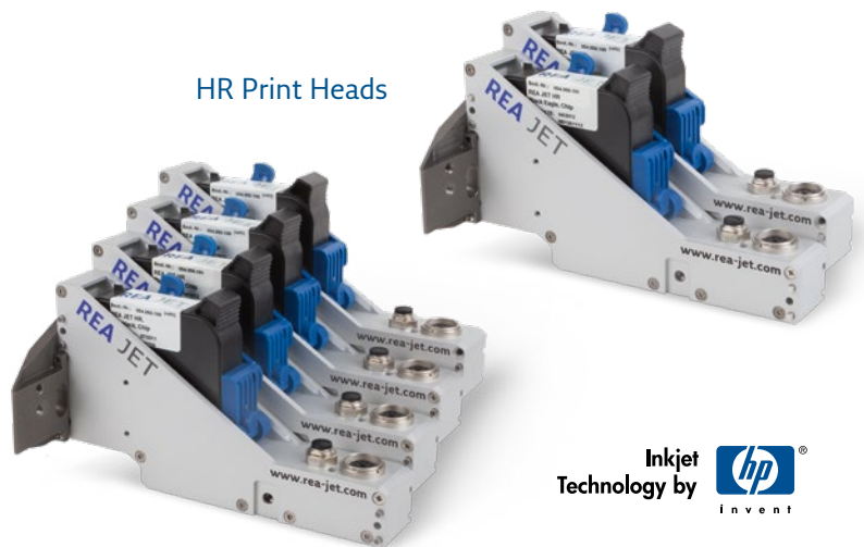
HR Print Heads