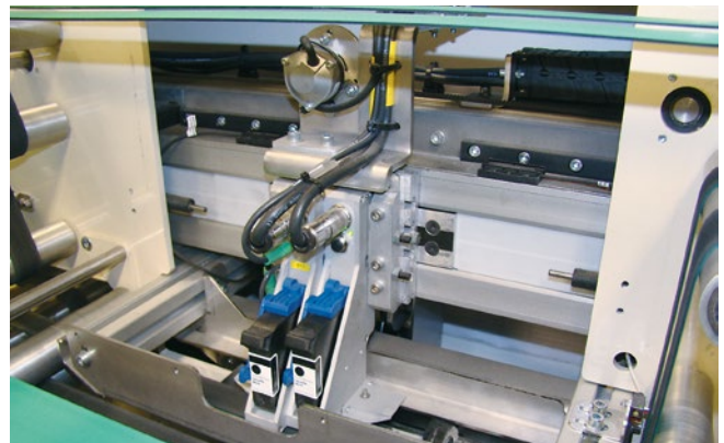
HR integrated into enveloping machine