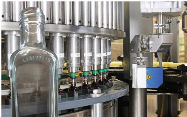
Laser marking of glass