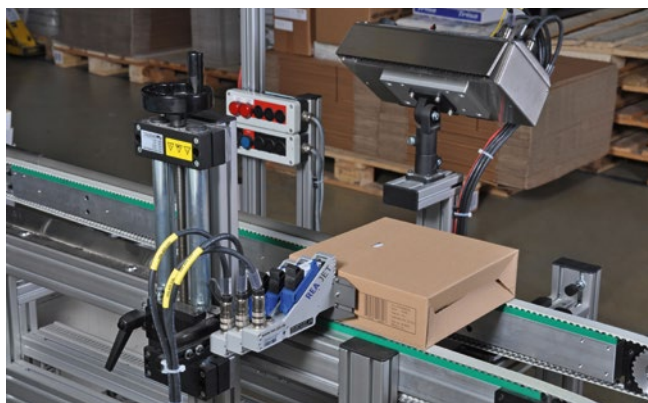
HR pro integrated into packaging line