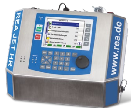
HR Controller for up to 4 print heads