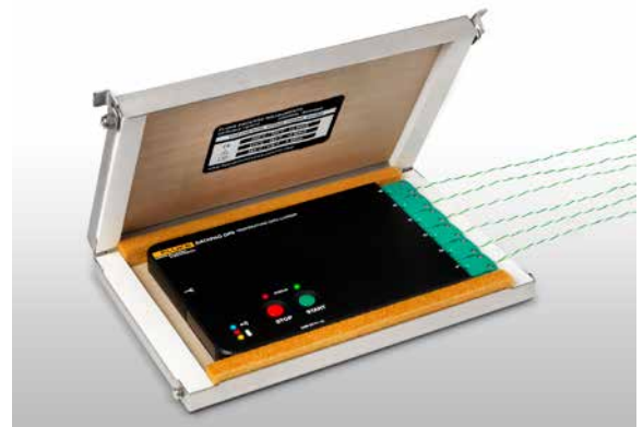
Datapaq DP5 data logger in thermal barrier

The Datapaq DP5 data logger can be specified with the optional TM21 radio telemetry system. This system has been designed specifically for use in high temperature conditions and providing the temperature readings in real time has proven its value in application from food cooking to steel slab reheating.