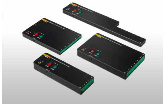
Datapaq DP5 data loggers

Included in Reflow Insight is the Easy Oven Set up (EOS) recipe calculation tool. EOS automatically calculates and informs the user of the optimum oven settings for a given product — saving time at every new product introduction.