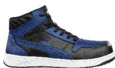
FRONTCOURT BLUE/BLK MID 630070