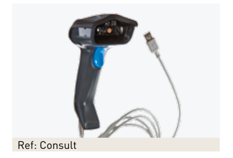
Barcode readers Scanner. RS-232 connection.

H330 mm column Ref: 494533B H660 mm column Ref: 494535B