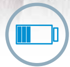
INTERNAL RECHARGEABLE BATTERY