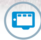
LED SEGMENT DISPLAY