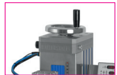
handwheel for height adjustment

EC Declaration of Conformity in accordance with EC Directive (Machinery Directive) 2006/42/EC,