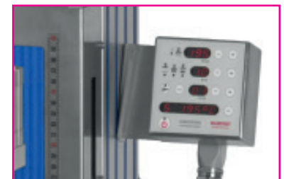
VARIOTRONIC temperature controller