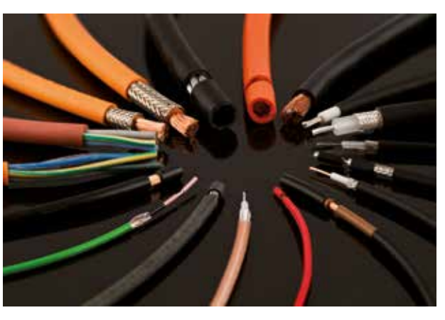
▲ Processing samples of cables with full and partial pull-off

The machine is available as a universal machine with swivel guide or as a universal/coax machine with split guides.