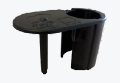
Ref: BL-P3623 Adapter for receipt printing in label printer Required for standard size receipt rolls.

Ref: BCH18 Barcode scanner Includes connection cable to the scale.