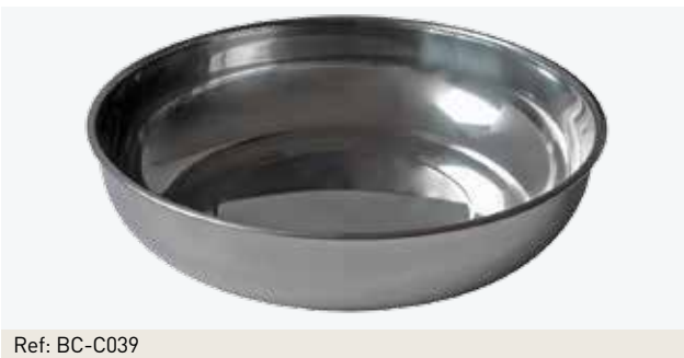
Deep plate in hanging scales Ø310 x H70 mm, instead of the semi deep plate.

Ref: BU-C1229 Flat plate for hanging scales L360 x W280 mm, instead of the semi deep plate.