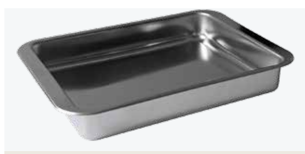
Ref: BCR74 Large Italian plate L407 x W284 x H60 mm.

Small Italian plate L357 x W235 x H55 mm.