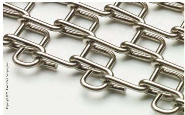
Compact-Grid™ conveyor belt with C-CureEdge®

Wire Belt Company Osterloh GmbH Ringstraße 20, 23923 Selmsdorf, Germany Tel: +49 (0) 38823 5445-0 | Fax: +49 (0) 38823 5445-19 | Email: sales@wirebelt.de