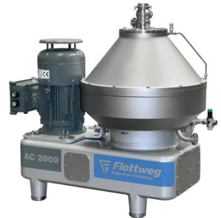
You can rent centrifuges, disc stack centrifuges, and belt presses from FLOTTWEG.