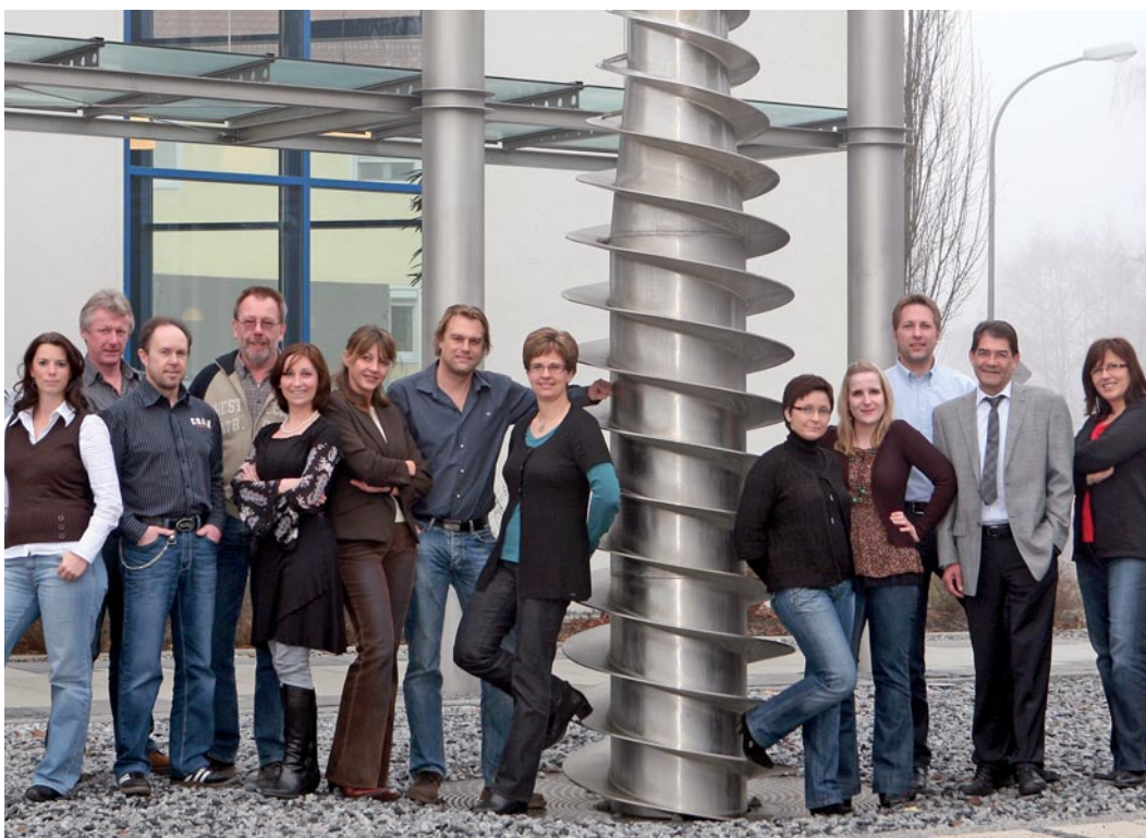
Your Flottweg service team in Vilsbiburg