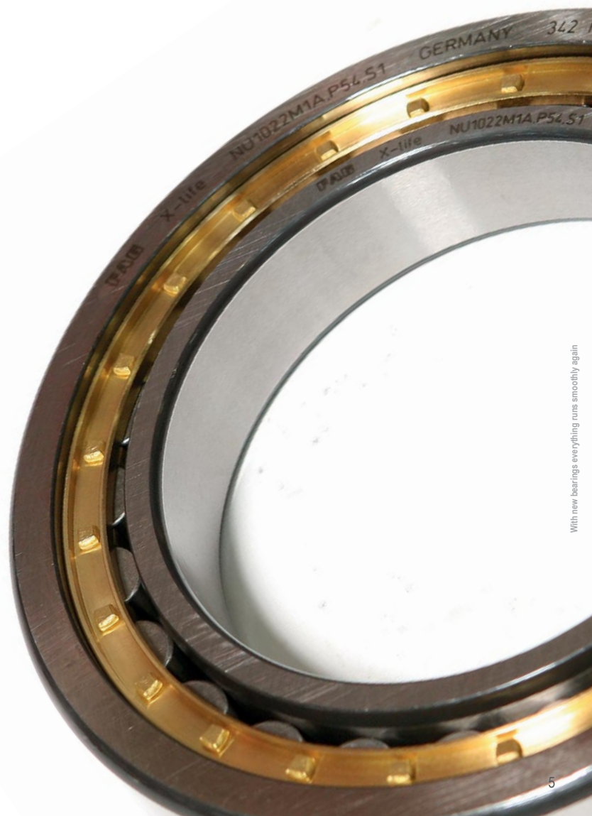
With new bearings everything runs smoothly again