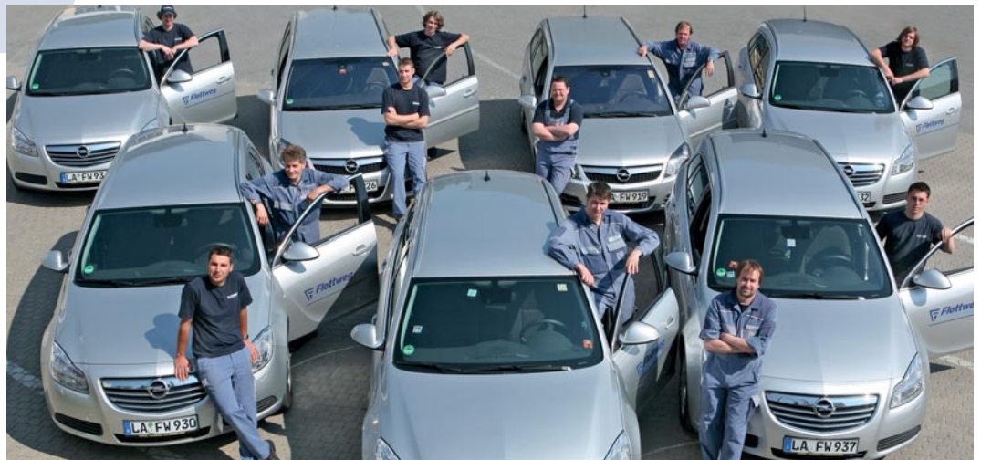
The FLOTTWEG service technicians are always ready for you

All branch offices and subsidiaries are listed on our website, www.flottweg.com .