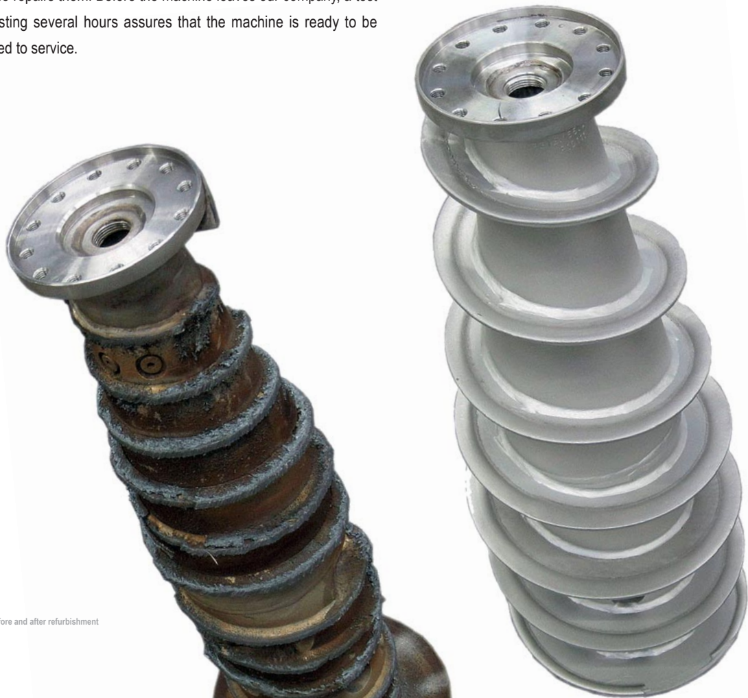
Scrolls before and after refurbishment

Profit from the know-how and the capabilities of the manufacturer.