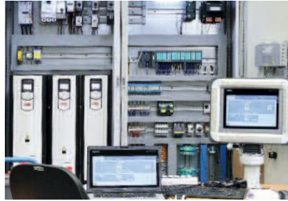
Customized solutions are tested in our test center