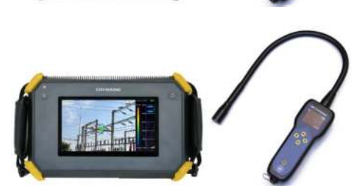
CRY2623 Pro Kit Superior version