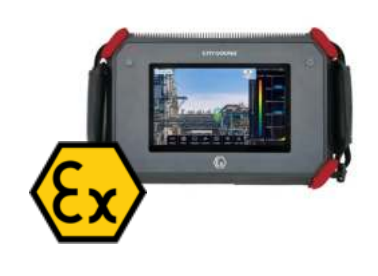
CRY2624 Superior ATEX version 128 MEMS