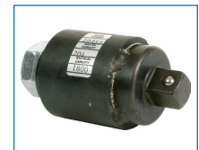
Optional: Rundown Fixtures (RDF) up to 340 Nm.