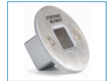
Optional: Square Adapters in misc sizes.