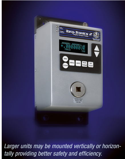
Larger units may be mounted vertically or horizontally providing better safety and efficiency.