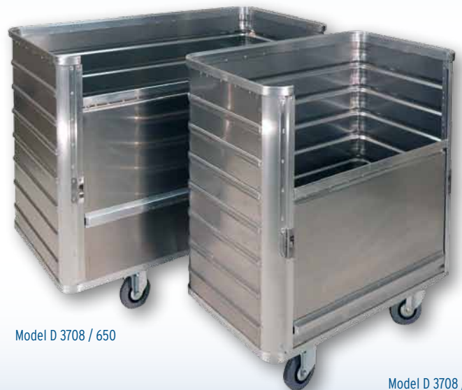
Model D 3708 / 650