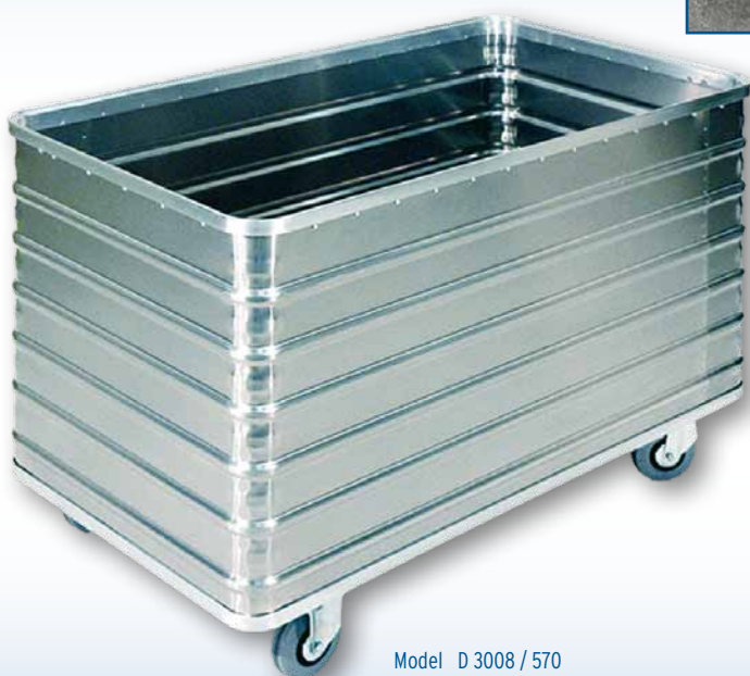
Model D 3008 / 570