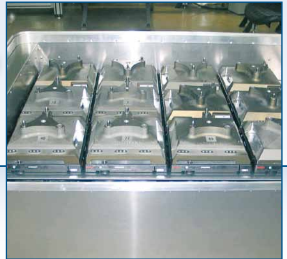
Loaded with engine block components