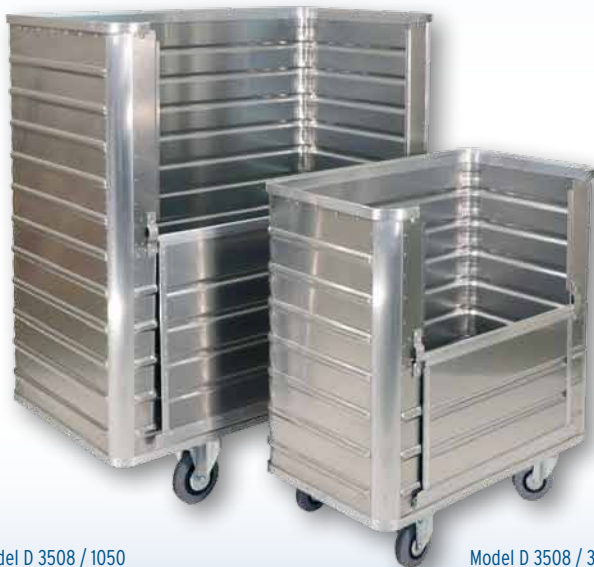
Model D 3508 / 1050