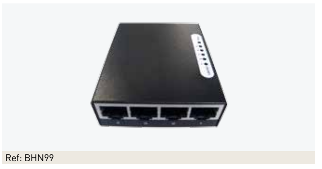
Interconnection switch For scales with rechargeable internal battery (W-010 B and W-020 B).