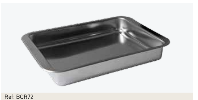
Large Italian plate L407 x W284 x H60 mm.