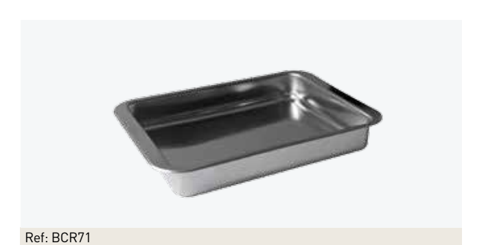
Small Italian plate L357 x W235 x H55 mm.