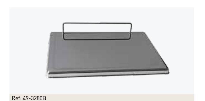
Flat plate with bar L360 x W260 mm.