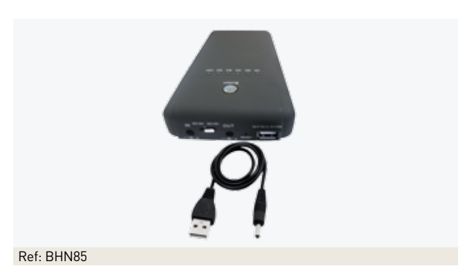
Battery for the switch

Power battery for the BHN99 interconnection switch.