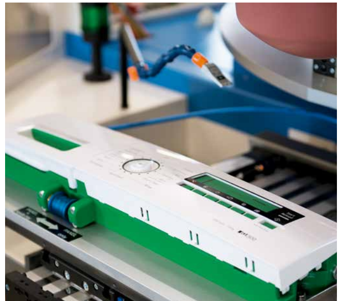
CONCENTRA 210-4 Jig with washing machine panel