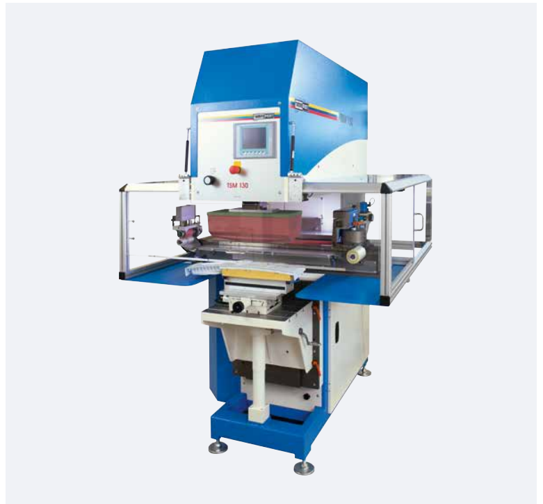
TSM 130 universal transverse doctor kit