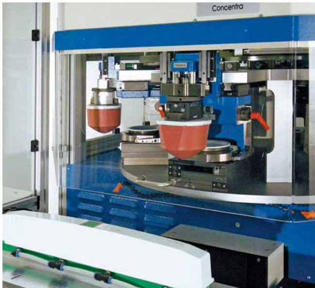
CONCENTRA 140-6 Jig with front cover