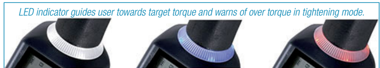
LED indicator guides user towards target torque and warns of over torque in tightening mode.