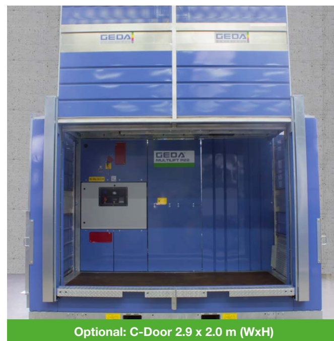
Optional: C-Door 2.9 x 2.0 m (WxH)