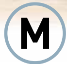
METROLOGICAL VERIFICATION OPTIONAL (EU)