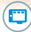
LCD SEGMENT DISPLAY