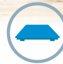
CONNECTABLE TO PLATFORM UP TO 14 LOAD CELLS