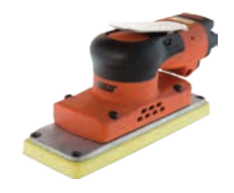
3 x 8 inch