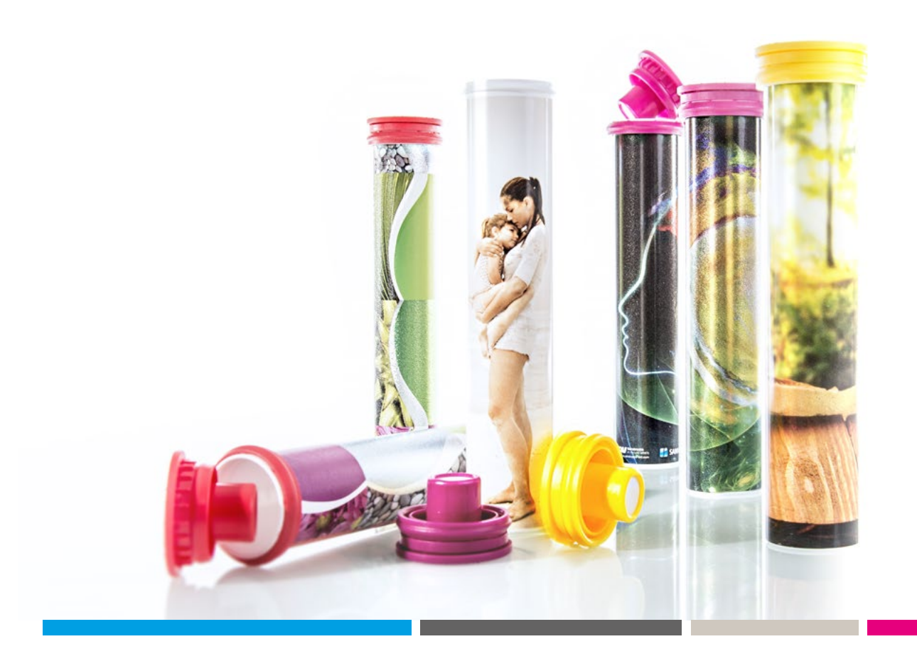
Sanner – Your complete solutions provider for tubes and closures