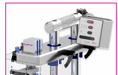
temperature control and height adjustment