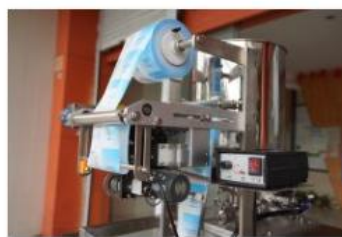
Linked film roller device