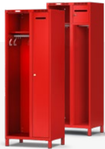
Dimensions HxWxD in cm