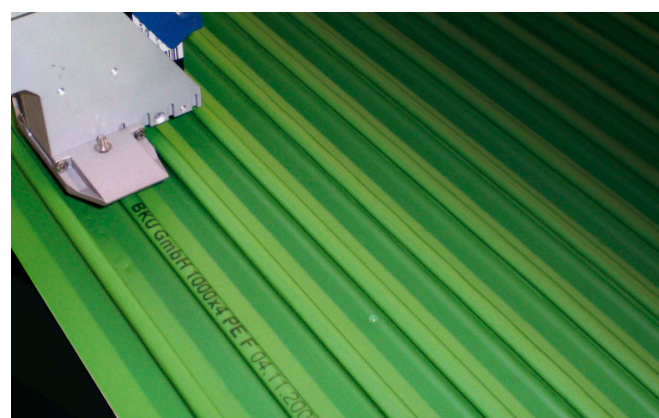
Coding of plastic profile plates