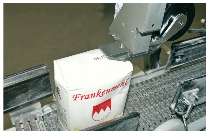
Marking of flour bags