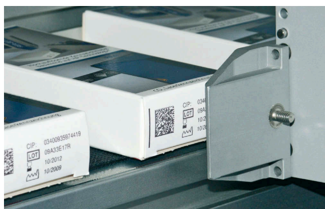
Cardboard box coding using DataMatrix code