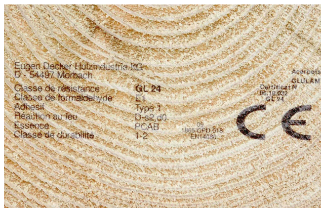
Marking of wood

* The availability of the individual functions depends on the available software status of the equipment.