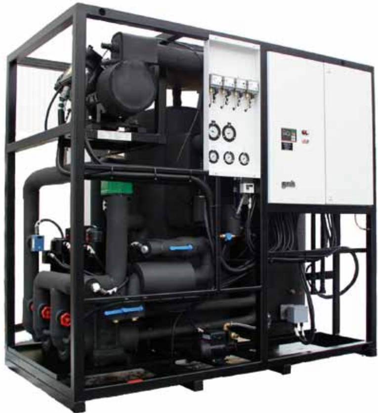
Chillers with integrated temperature control circuit for temperatures of the medium from -30 °C to +90 °C