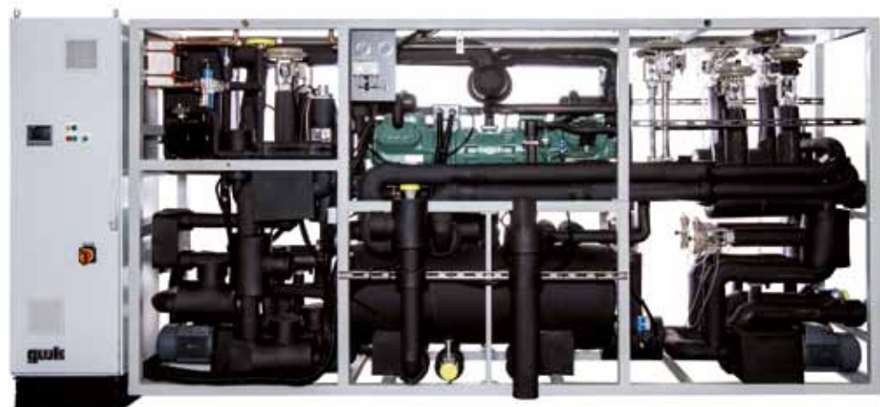
Customised low-temperature chiller