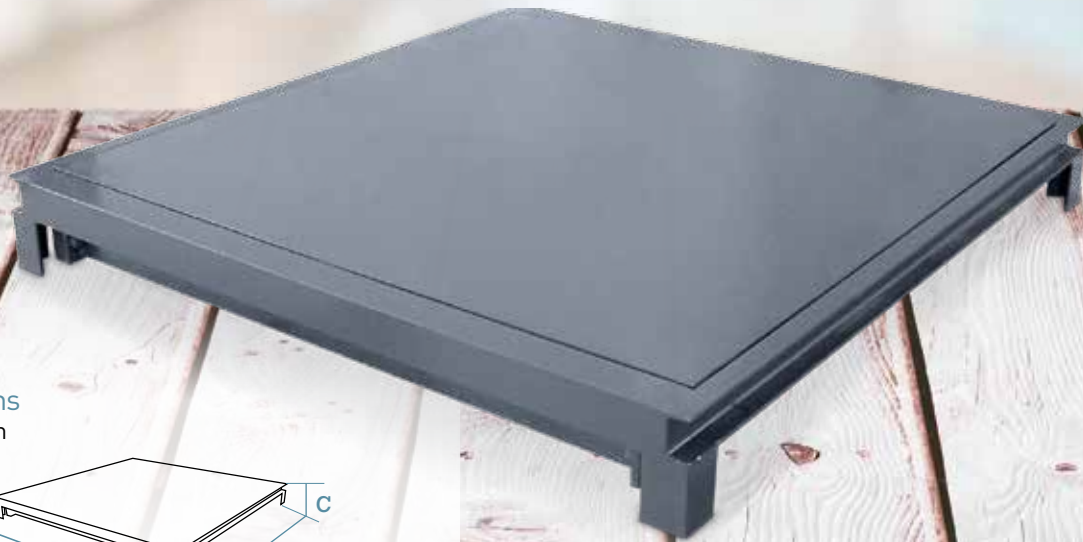
Dimensions DATA IN mm