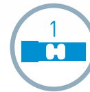
1 LOAD CELL