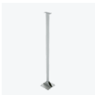
Stainless steel column for indicator