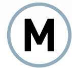
METROLOGICAL VERIFICATION OPTIONAL (EU)