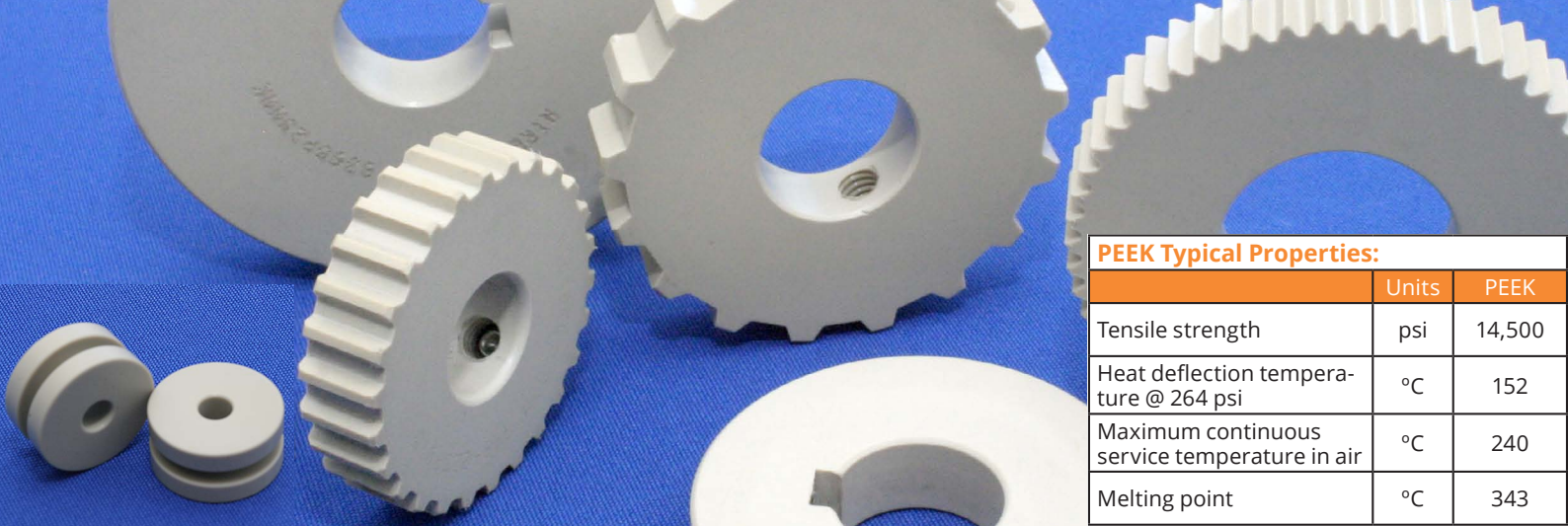
PEEK Typical Properties:

The Trusted Metal Conveyor Belt Manufacturer