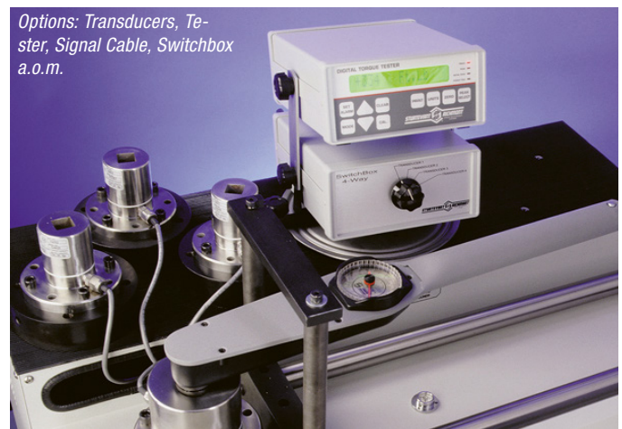
Options: Transducers, Tester, Signal Cable, Switchbox a.o.m.