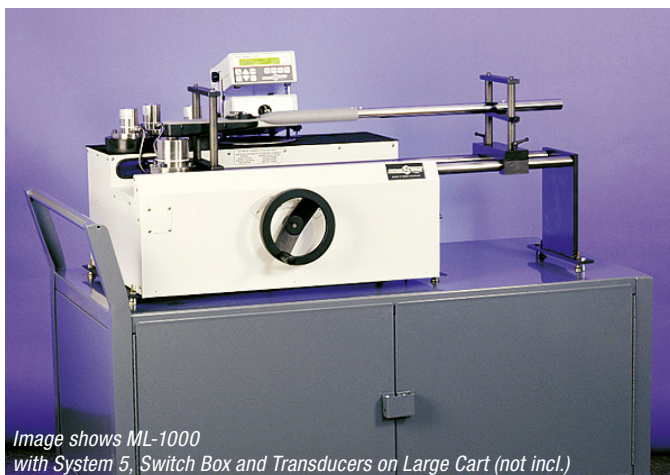
Image shows ML-1000 with System 5, Switch Box and Transducers on Large Cart (not incl.)