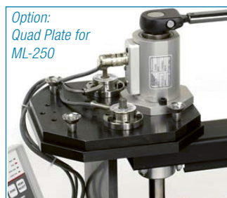
Option: Quad Plate for ML-250