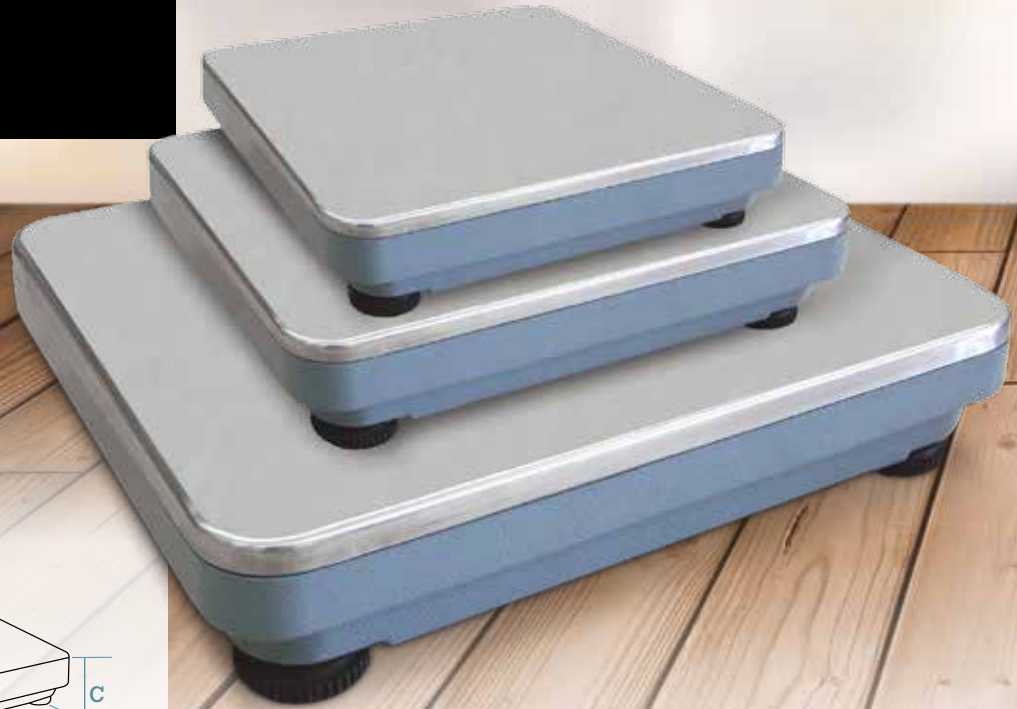
Dimensions DATA IN mm