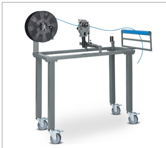
Abb. 2 MESSROL 450 incl. spool winding axle, MESSBOI 30 and inlet roller