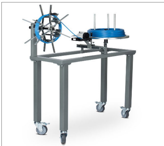
Abb. 1 MESSROL 450 complete device