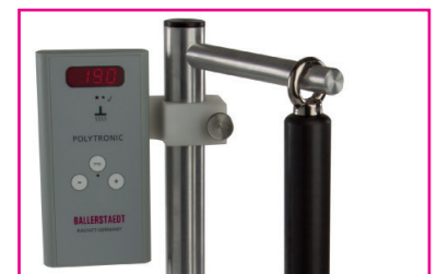
fixture of control unit and suspension

Complies with Directive 2006/95/EC (Low Voltage Directive).