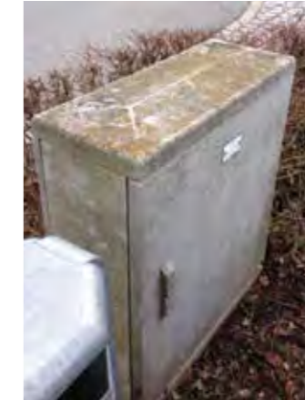
“Blooming” and heavy contamination after several years

Additional handling and logistical effort – for the internal coating system, for example, or for an external contract coater – is no longer necessary.