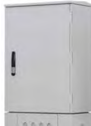
Continuous protection of the SMC components due to PIMC coating