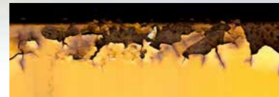
Single-layer polyester powder coating

Powder-in-powder technology offers greater protection compared to single-layer polyester powder coating – in particular at the edges