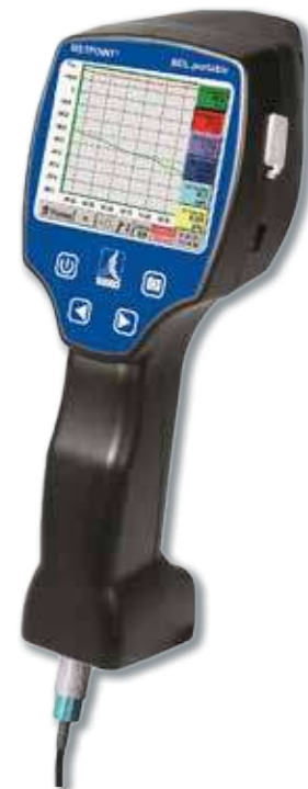
Image of portable measuring device