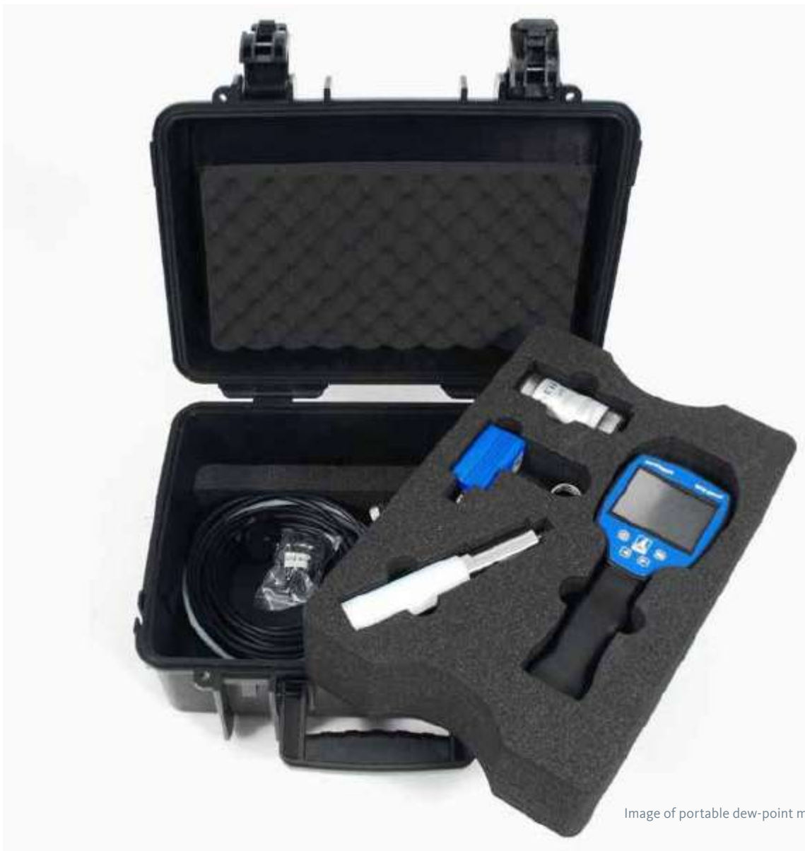
Image of portable dew-point measuring set

Flexible graphic presentation of measurement values