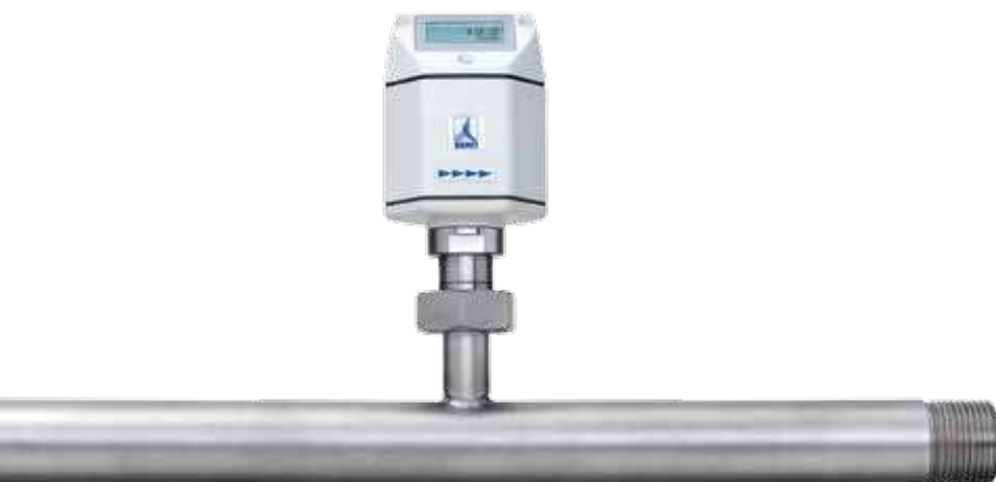
The FS211 is the compact version of the METPOINT® FLM.